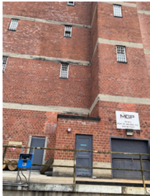
Formerly known as MGP, Ross & Squib is making some of the finest whiskey in the country.

The old whiskey plant in Lawrenceburg, Indiana, was officially founded in 1847, but production likely began many decades earlier. Once the target of hit pieces by irreverent drinks journalists, it was originally home to at least two distinct distilleries before its current incarnation as the Ross & Squib Distillery. In 1933, the sprawling facility was purchased by the Seagram's Company and spent nearly the next seven decades focused on making their famous American