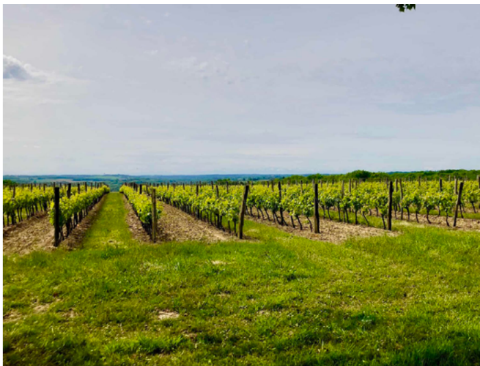
Vineyards at Château de Pellehaut.

1990 The Rare Armagnac Collection (Domaine de Pouchegu) K&L Exclusive Vintage Armagnac (750ml) $139.99