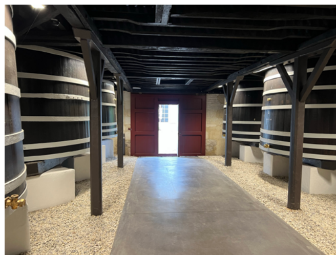
Barrel room at Lynch-Bages.

Lynch-Bages, Pauillac 6-Pack in OWC (Pre-Arrival) $835.00 & 2022 Lynch-Bages, Pauillac (1.5L) (Pre-Arrival) $279.99 & 2022 Lynch-Bages, Pauillac (1.5L) 3-Pack in OWC (Pre-Arrival) $835.00 98-99JS 96-98JD 97DC 97JA 2022 is a blend of 66% Cabernet Sauvignon, 28% Merlot, 3% Cabernet Franc, and 3% Petit Verdot.