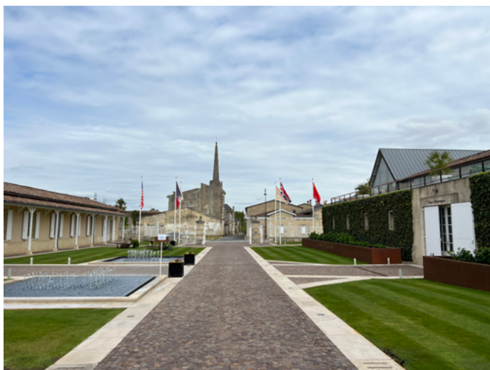
St-Julien's Léoville-Poyferré shines in 2022.

A successful region in 2022 along with Margaux.