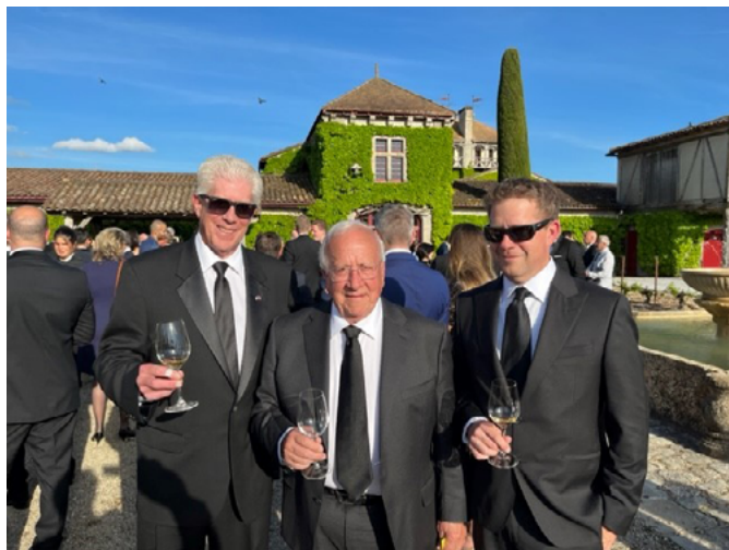
Le Ban du Millésime party Thursday night.

2022 Angélu, St-Émilion (Pre-Arrival) $449.99 & 2022 Angélu,