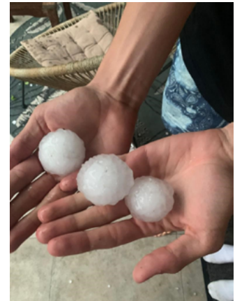
The next day: hail on June 21st.

The 2022 Château Latour is classic Latour with power and precision. Loaded with deep, focused, old-vine fruit; super fresh but tightly spun, with hints of black olive and walnut. No surprise here: a long runner. 2 Stars!