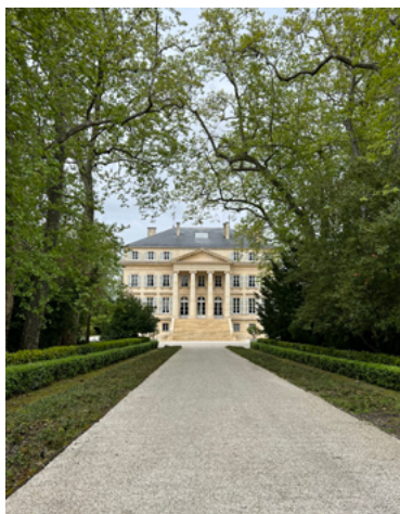
The Margaux commune produced some very fine wines in 2022.

Wonderful purity and power. One of the top wines from the Margaux appellation. A blend of 55% Cabernet Sauvignon, 40% Merlot, and 5% Petit Verdot with an alcohol level of 14.5%.