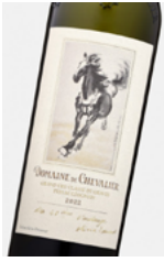
Domaine de Chevalier's Blanc gets a new label this year.

Of course 2022 Haut-Brion Blanc, Pessac-Léognan (Pre-Arrival) ( $Inquire ) and La Mission Haut-Brion Blanc were outstanding. But they are a bit above my pay grade.