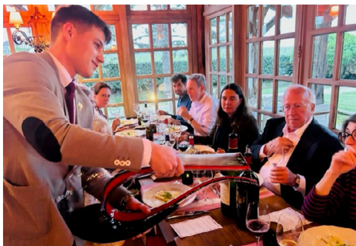
Scenes from the last night of the trip: dinner at Caudalie in Pessac-Léognan.