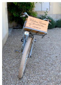
Bike at Château Canon.

Canon $119.99 A star of the past 10 years, Canon does not disappoint with their 2021. No frost problems and normal production of 40 hectoliters per hectare. 70% Merlot and 30% Cab Franc. Blackberry and spice aromas. Sweet palate entry and good mid-palate fruit. Full bodied, dense, high-acid, fresh style. A bit closed at the back end. Old-school Canon like the delightful 1983. Canon produced a lovely Grand Vin that's marked by its supple entry, flavors of black