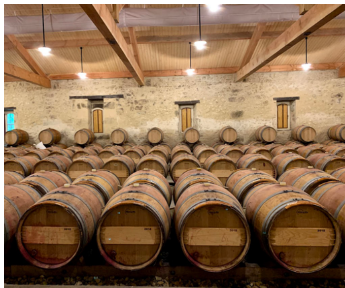
The cellars at Langoa-Barton.