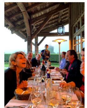
Last night in Bordeaux on the 2021 trip. Many laughs while the summer storm thundered all around us.

May and June: Some localized frosts were recorded even in early May, which was gloomy, cool, and wet. Vine growth slowed down. Summer weather finally set in from early June, and flowering unfolded in favorable conditions, a week later than the 20-year average. The last half of June saw storms and abundant