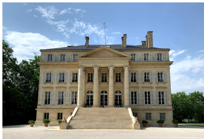
The storied Château Margaux.

Other highlights include a set of wines that seem to be able to do no