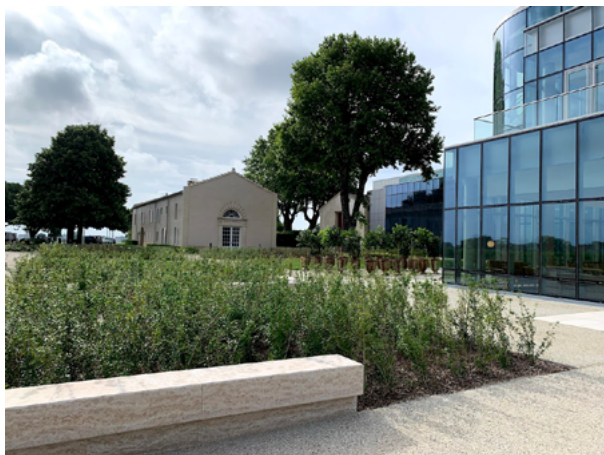
New cellar at Lynch-Bages.

Lynch-Bages $119.99 The 2021 Lynch-Bages shows lovely upfront fruit and spice. In the mouth the wine is fleshy and rich, with ripe fruit tannins that carry the wine through to the finish. Lots of polish with plenty of concentrated black fruits. The blend in 2021 is 67% Cabernet Sauvignon, 25% Merlot, 3% Cabernet Franc, and 5% Petit Verdot.