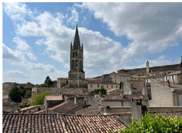
Rooftops and a beautiful spring sky in St-Emilion.

Lespault-Martillac 65% Sauvignon Blanc, 35% Sémillon. Exotic tropical fruit aromatics (Star fruit), Full of spices and honeyed ripe peach. A delicious wine. Will sell when in stock. JM