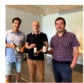
The team at Tour St-Christophe is responsible for our one of our perennial

2020 Tour St-Christophe, St-Emilion 750ml $32.99