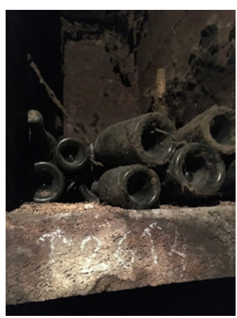
Stock up now on the 2020 vintage it's an excellent, cellar-worthy one, but quantities are very limites.

2020 Domaine Bouchard Père et Fils Montrachet Grand Cru $899.99 98DC 96-98JM 95-97WA 93-95VN