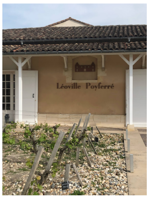
From the K&L team's 2022 visit to the property to taste the 2020 vintage.