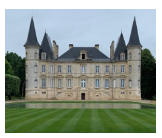
An enviable zip code: neighbors Pichon-Lalande and Pichon-Baron consistently perform at the head of the pack.

Such is the case with 2020 Montrose, St-Estèphe (Pre-Arrival) $194.99 98-100VN, a mere taste of which had us musing about its potential as wine of the vintage. Those critics that have tasted it (not many did; they didn't send samples around) seem to echo our findings. A Montrose of this caliber is one that is not to be missed.