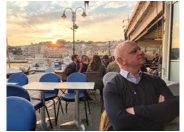
Scenes from the seaside village of Cassis, home to many fine summer sippers—and perfect summer sipping locales.