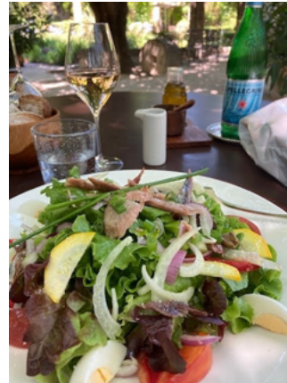
A snap from our co-owner Clyde on his recent trip to Provence. A perfect lunch with rosé and salade niçoise.

It is a classic with summer fare (try salade niçoise), and would stand up to anything from the grill. Pro tip: it's delicious this year, but will be even better the next!