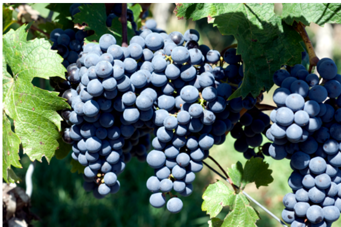
The noble Cabernet Franc grape is a parent grape of Cabernet Sauvignon. Often used as a blending grape, it finds its best expression in the Loire Valley.