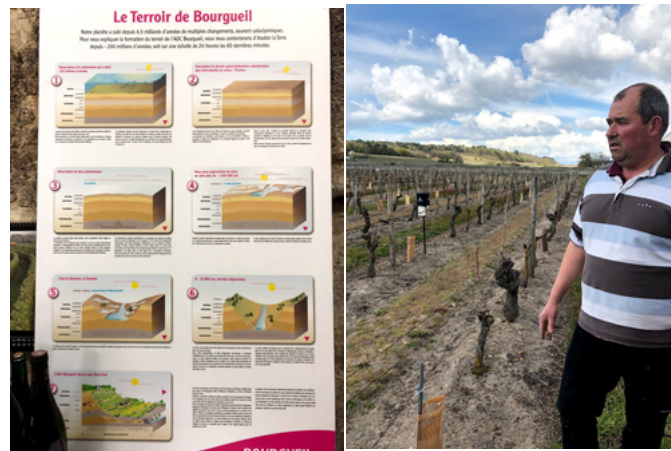
Domaine les Pins in Bourgueil has been a solid producer for us and in the region for years. In fact, the family has five generations' worth of experience exclusively with Cabernet Franc.

all my selections in these pages, with flavors of black olive, rosemary, currants, and graphite. This wants a pairing with some grass-fed beef. I recommend a hangar or a pichaña-style cut. The meatiness in both the wine and the beef are a match made in heaven.