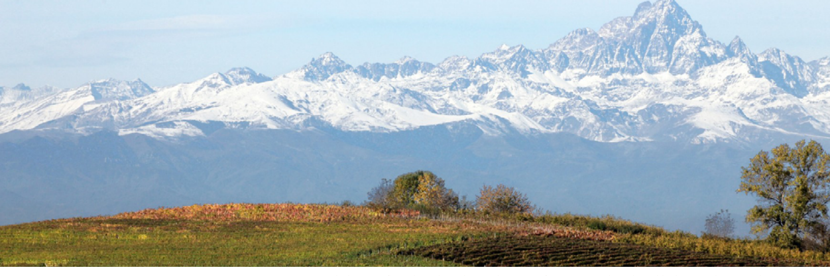
Cool Alpine air flows throughout the Langhe region of Piemonte, making the Nebbiolo grapes happy as clams.