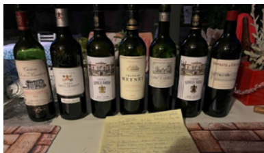
A lineup for the ages alongside Ralph's tasting notes.

95DC 95VN 95WE 95WS Let's start in Pessac. The first vintage at this estate was 1259—good dirt then, good dirt now. I first tasted here with Clyde in April 1990, and I have great memories of the classic 1988 and 1989. As good as they were then, the wines today