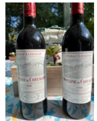
Ralph pulled out the last '88 and '89 from his cellar.

97WE 96WS 95WA The next stop in Léognan on the same trip was Domaine de Chevalier, where we were lost and late! The team of Olivier Bernard's family and winemaker Rémi Edange welcomed us then, as they still do today. The wines are as great as they ever have been, and they are very different style-wise than Pape. DDC wines are packed with great-tasting, silky, blood-red fruits with good zest, incredible balance, and elegance. Great purity of fruit, texture, elegance, and balance are the key characteristics at DDC. In my opinion one of the very best from the 2018 vintage. Reminds me of the 1988. I've got 10 vintages in my cellar.